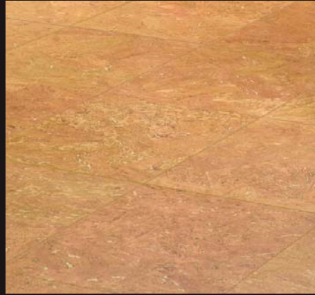
Alba - KRCA05