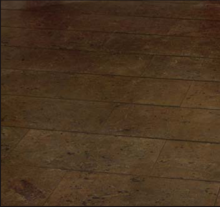
Barolo - KRCA04