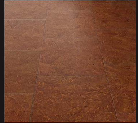
Saluzzo - KRCA06